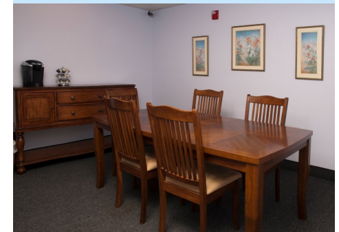
Conference & Break Room.