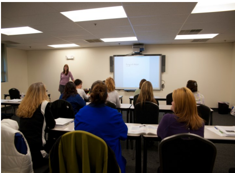
Large Classroom 720 Square Feet with SMART Board Technology.

Training facility is across the street from Hyatt House Boston/Burlington Hotel and near the Burlington Mall where there are restaurants to fit every budget. Just 16 miles from Logan International Airport and a 20 minute drive to all the sites in Boston, this facility offers all that you will need to accommodate your attendees.