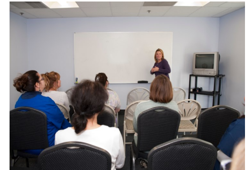
Small Classroom 300 Square Feet with wall mounted white board.